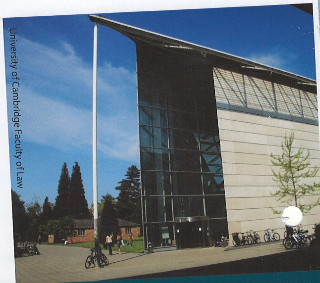
University of Cambridge Faculty of Law

We are delighted to be able once again offer students the opportunity of a guided tour of the Supreme Court in London. The tour will take place on 16 July 2014. There is no extra charge involved and transport will be provided.